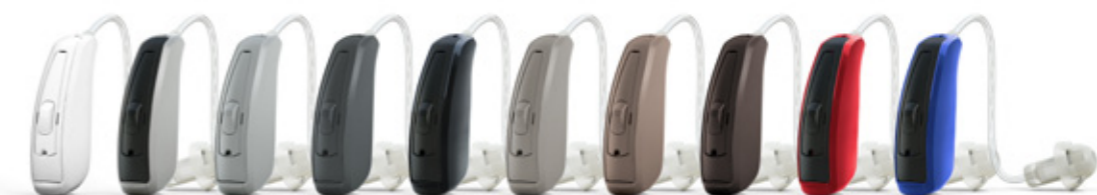
ReSound LiNX comes in a choice of 10 attractive colors. Actual size shown.